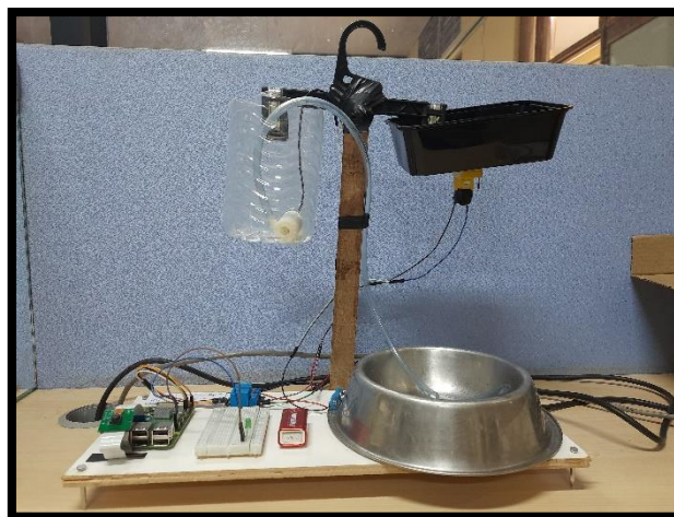
Pet Care System – 1 st Prize