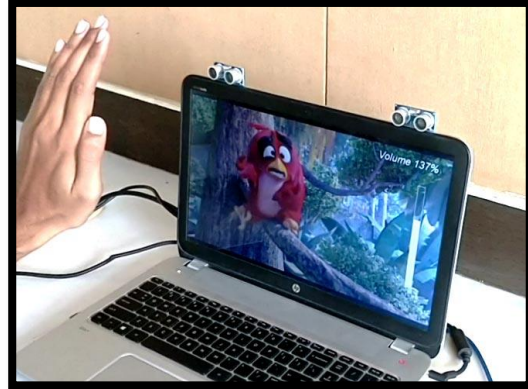
Hand Gesture Controller using Python (IoT) – 2 nd Prize